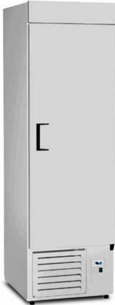
I-Eve P M*